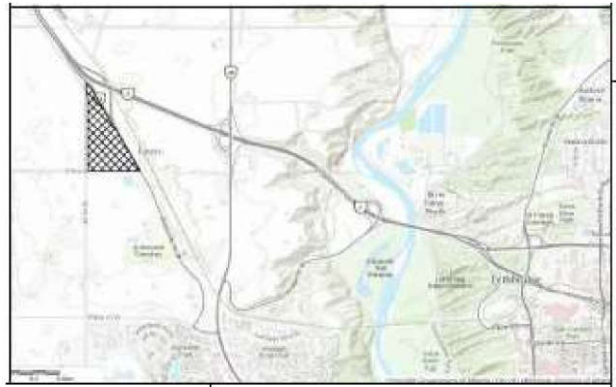
The project is located on SW 10-9-22-W4M, municipal address 2910 Westside Drive W Lethbridge, Alberta.

As a future long-term owner and operator of solar power projects in Southern Alberta, NU-E is committed to building lasting partnerships and achieving positive social impacts for the communities in which we work, live and play.